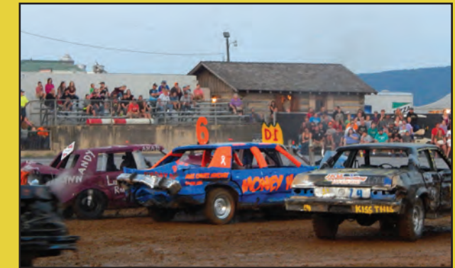
"Children's Day" - Sponsored by SPRINT Free Admission Ages 12 and Under All Day