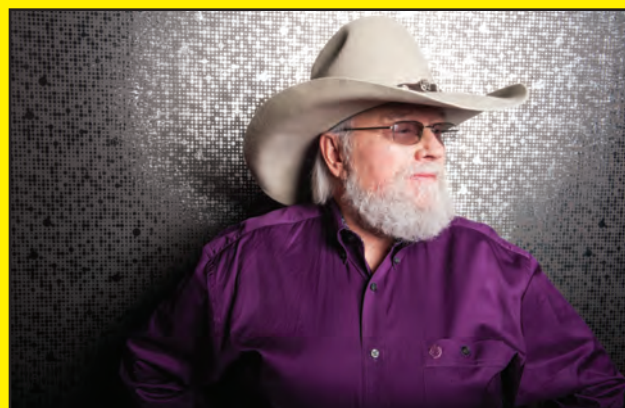
"Veterans' Tribute Day" FREE ADMISSION for Veterans Until Close