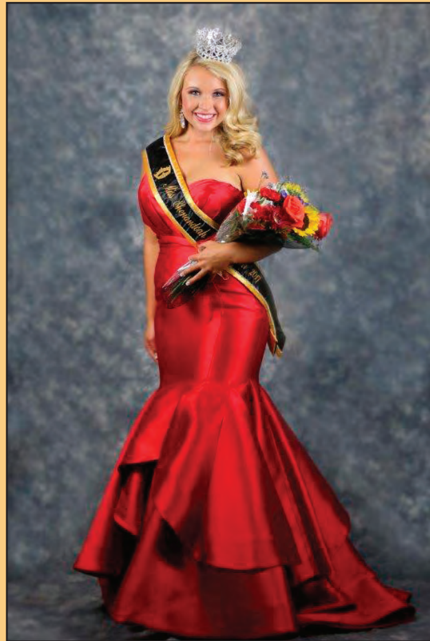
Miss Shenandoah County Fair Scholarship Pageant - Central High School