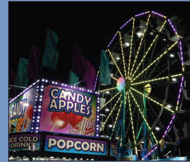
"First Bank Family Night"