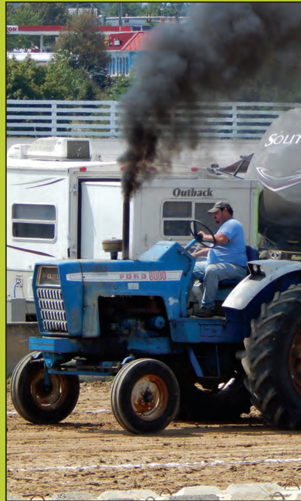
Free Gate Admission All Day No Rides or Exhibits Open