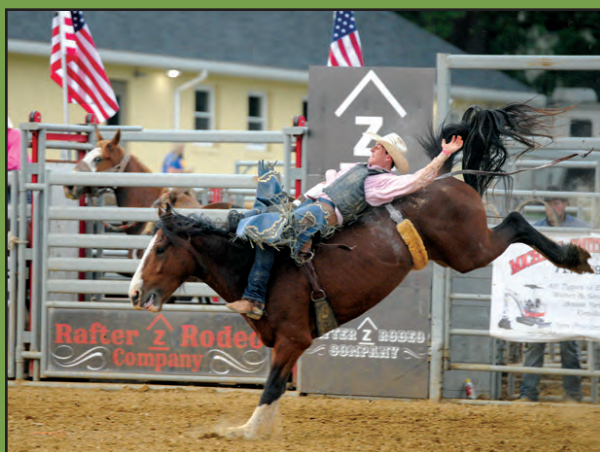
"Senior's Citizen's Day"